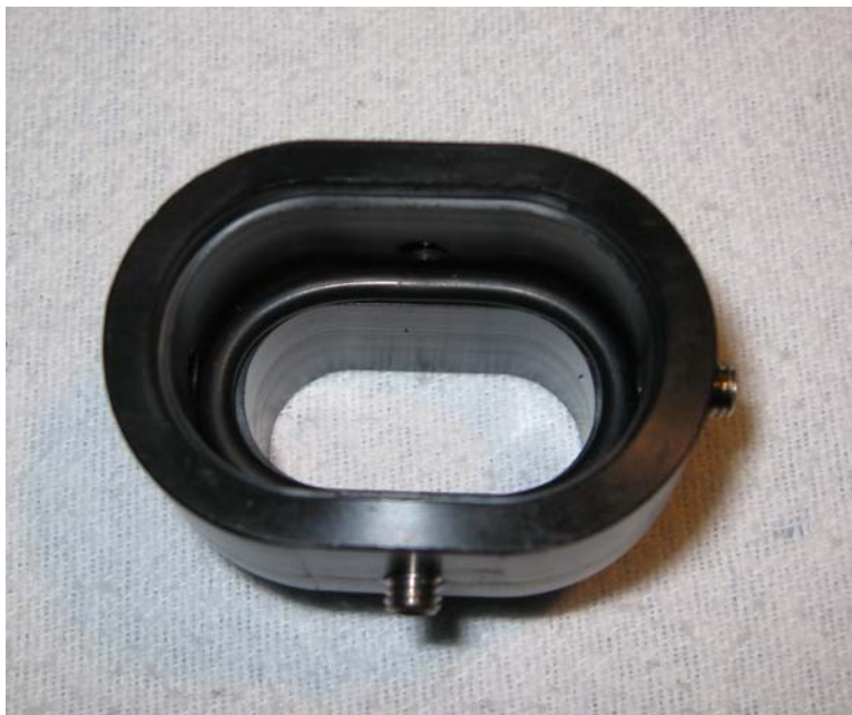
Inside view, this o-ring is sealing! It must be in the proper position and in good shape, greased.