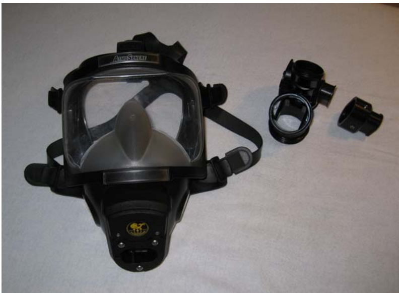
Mask, Discovery DSV house and adapter

Right side: the original o-ring in the mask, take care it is lying in the correct position.