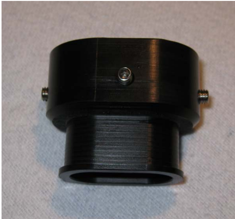
The Adapter with set screws, to be fit to the DSV

What is written here is what I did..and it may have errors, so please do not copy it.