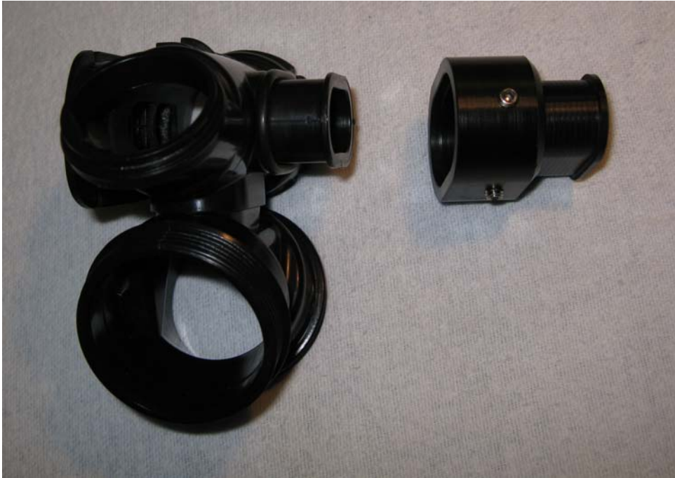
DSV and adapter. The o-ring on the mouthpiece, left side, on the DSV is only for stability reason, it has NO sealing function!!!